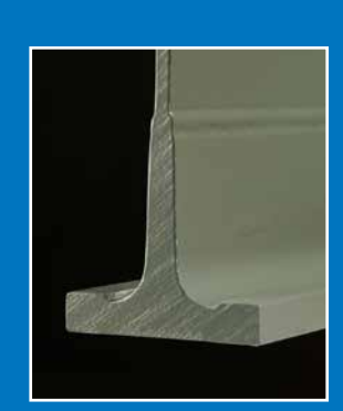
Our Tarca<sup>®</sup> Track's standardized lower flange provides compatibility.

In other words, Tarca<sup>®</sup> rails can adjust to loads as they move, enabling carrier wheels to maintain consistent contact. This "load balance" of the wheels and components allows for longer life with less maintenance.