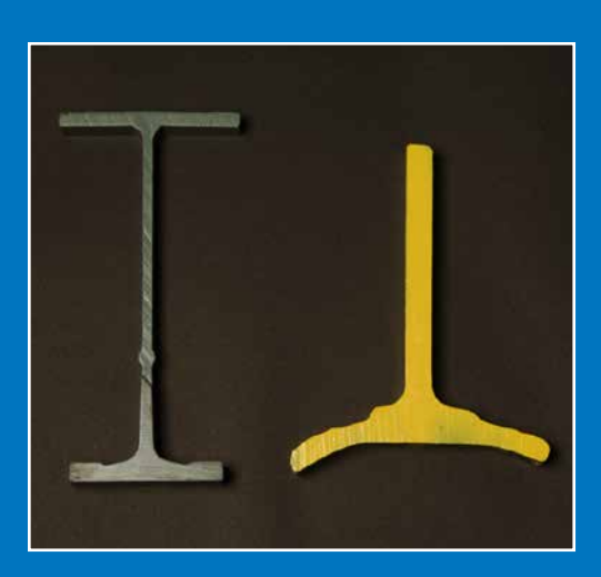
Peening caused the mild steel flange on this I-beam (on right) to bend, making it completely unsafe for crane travel.