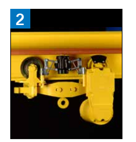
Photo shows carrier with drive and SAFPOWRBAR ^{\circledR} electrification.

Tarca<sup>®</sup> is designed to provide maximum spanning capability for heavy loads while minimizing the weight of required material. Its material properties resist peening and assure a longer operating life than ordinary track designs.